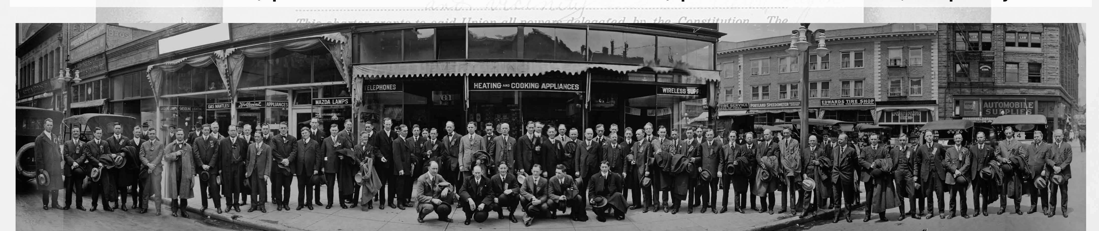
June 28, 1916 Oregon Association of Electrical Contractors and Dealers, taken in front of Stubbs Electric Co. SW 8th and Pine Streets, Portland OR

WORKWEEK 40 hours OVERTIME 33¢ per hour HELPER'S WAGE $1.00 per day