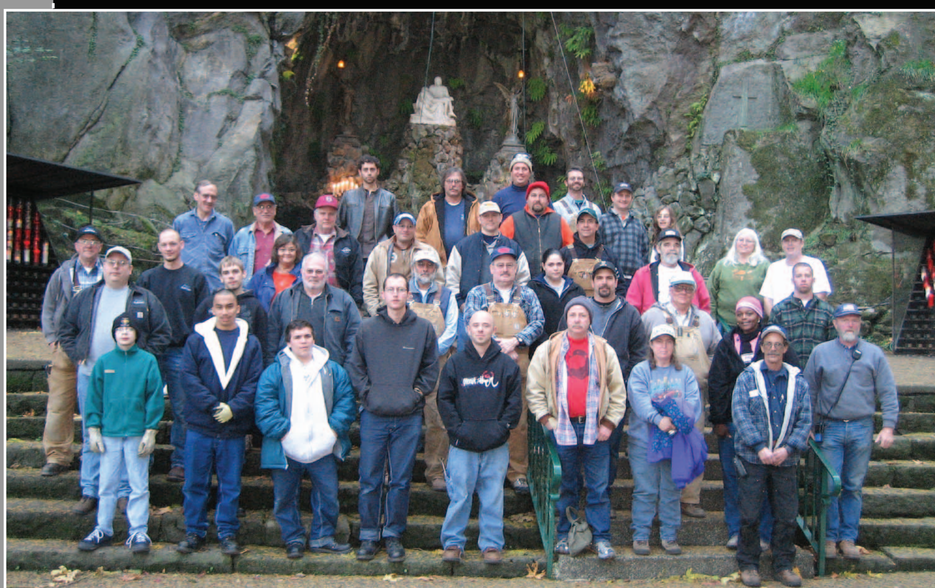
THE GROTTO LIGHTING CREW - 2008

"It's important that the wiring is done right. It is such a big event that is held outside in the rain. I take responsibility for making sure the Grotto is both a beautiful and safe experience for the visitors."