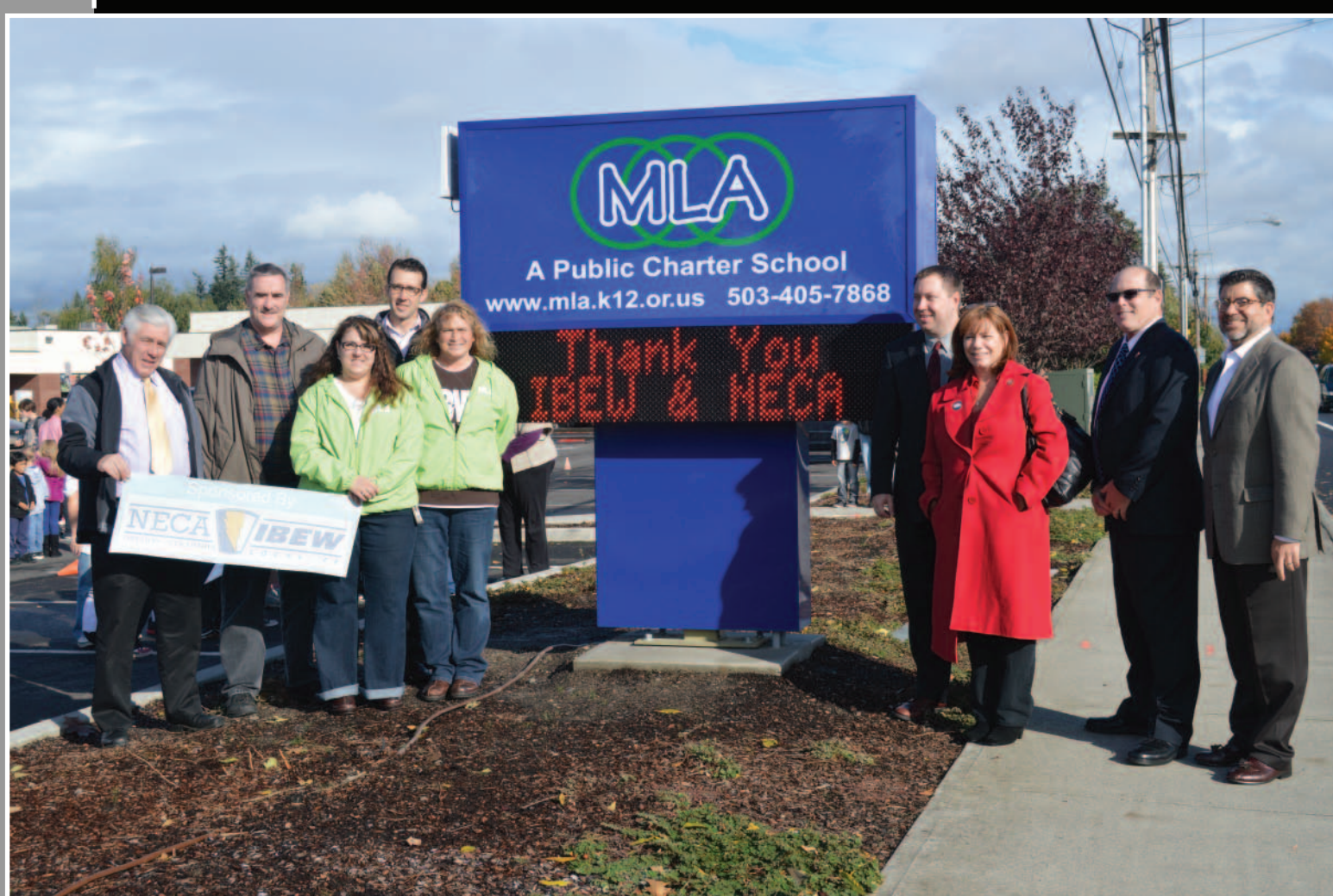
MULTISENSORY LEARNING ACADEMY CHARTER SCHOOL, FAIRVIEW - 2012