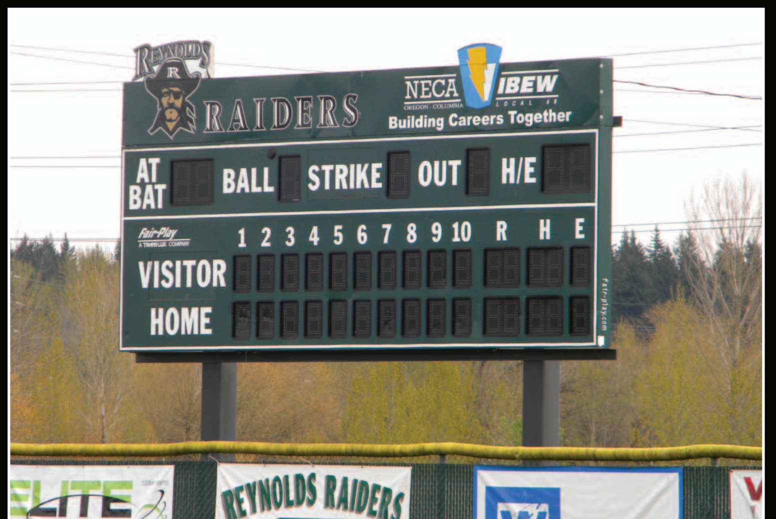
REYNOLDS HIGH SCHOOL SCOREBOARD - 2011