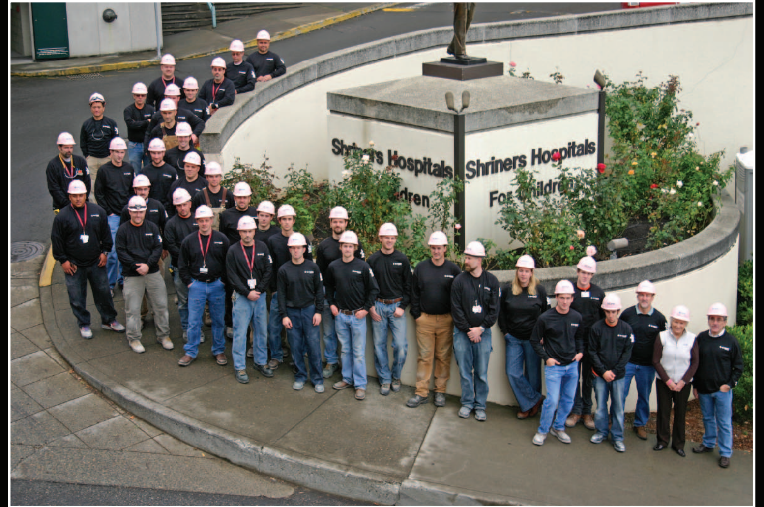
DYNALECTRIC'S PINK HARDHATS FOR BREAST CANCER AWARENESS MONTH - 2010